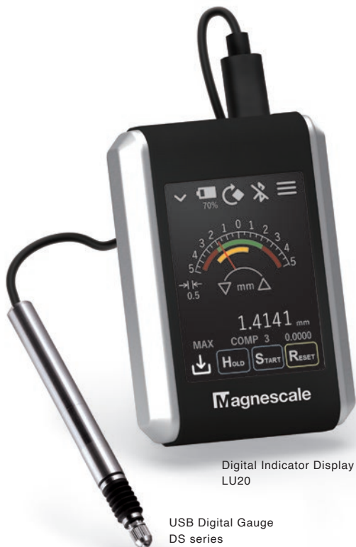
Digital Indicator Display LU20

USB Digital Gauge DS series (Sold separately)